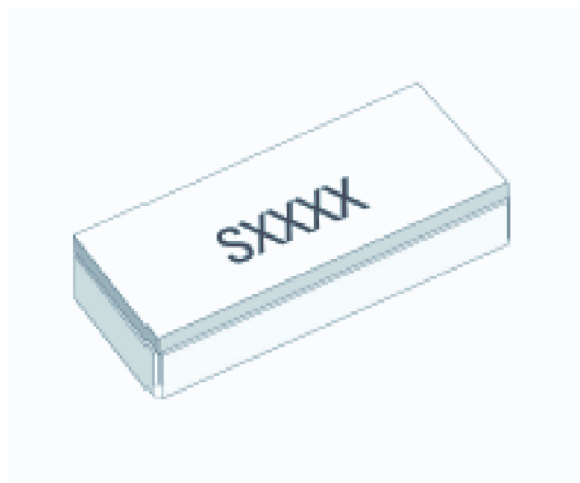
Outline (mm) -SM1 = Gold plated (RoHS)