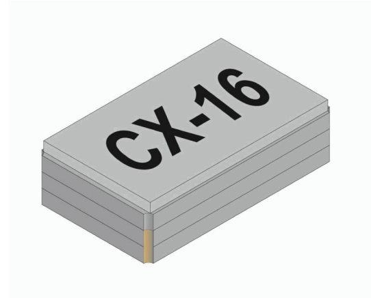
Outline (mm) -SM1 = Gold plated, glass lid